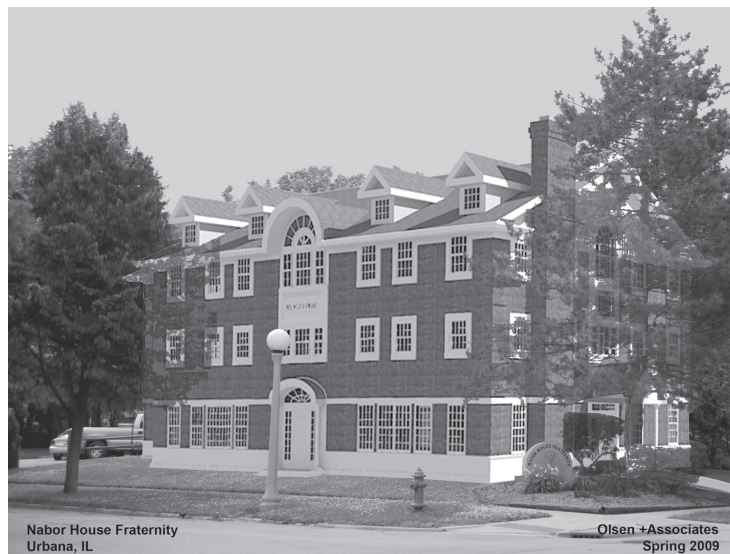
Nabor House Fraternity Urbana, IL

We have made amazing progress in the fundraising efforts. Since just last August we have raised nearly $1.4 million dollars for the new house. The total cost of the new house project is now estimated to be around $2.3 million. We have financing in place to complete the project but we hope to raise more funds from the alumni this summer to lower our debt levels. Please consider contributing to the building project. Now is the time to contribute if you have not done so already.